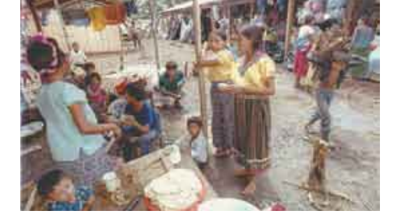
The U.S. forestry industry recruits many of its guestworkers from Huehuetenango in Guatemala, where many indigenous people live in extreme poverty with few opportunities to earn wages.

These obstacles are compounded when employers fail to offer as many hours of work as promised — a common occurrence.