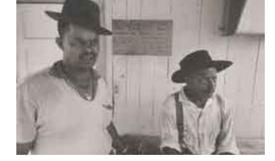
Labor organizers in the 1950s exposed widespread abuses of migrant farmworkers.

that Mexicans, who had been deported en masse just a few years earlier, were easily returnable.<sup>6</sup> This program was designed initially to bring in a few hundred experienced laborers to harvest sugar beets in California. Although it started as a small program, at its peak it drew more than 400,000 workers a year across the border. A total of about 4.5 million jobs had been filled by Mexican citizens by the time the bracero program was abolished in 1964.