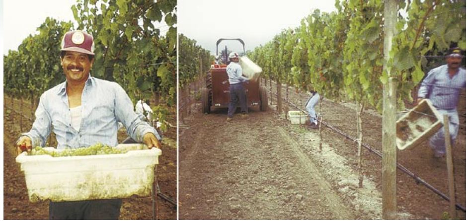
In wine grape vineyards, harvest workers suffer from a high rate of musculoskeletal disorders. Switching to a smaller picking tub can reduce the level of reported symptoms without significantly affecting productivity.

Total costs for a first-time back injury can reach $10,000, with costs for repeated back injuries reaching as much as $300,000 (OSU Research News 2001; NRC-IOM 2001). With an average of 3,350 back injuries reported each year