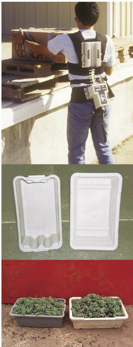
Top, the authors fitted workers with an exoskeleton called a Lumbar Motion Monitor to study their movements during a simulated hand-harvest of grapes. Middle, the intervention tub (left) and standard tub (right). Note the smooth bottom and added handles on the intervention tub. Bottom, the intervention tub holds an average of 11 pounds less grapes than the standard tub.