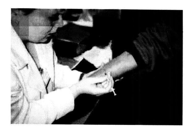
Figure 1 TB Tuberculin Test