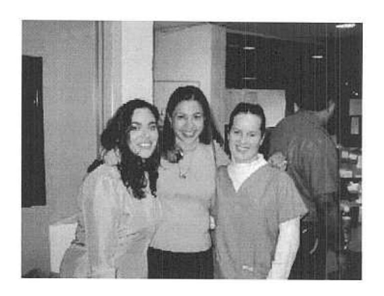
Figure 3 Student Participants

This is but the first step in a mutually beneficial collaboration. Based on the success of these initial presentations, others are being planned for the spring.