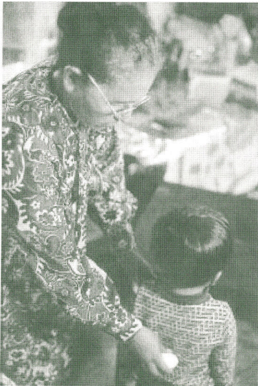
A curandera treating an illness ( mal de ojo ) involving the supernatural, rather than natural part of the material.

from early Judeo-Christian healing traditions. Other roots derive from Europe in the Middle Ages, utilizing Old World medicinal plants and magical healing practices from Medieval witchcraft. Moorish influences from the conquest of Southern Europe are clearly visible in curanderismo, including folk illnesses such as mal de ojo (the evil eye), homeopathic concepts, and common home remedies for conditions such as earaches (garlic [ Allium sativum ]), burns ( Aloe vera ), and stomachaches (orange [ Citrus aurantium L.] leaf tea). There are significant Native American traditions included in curanderismo, such as folk illnesses from pre-Columbian times (fallen fontanel; also known as caída de la mollera ) and the extensive pharmacopeia of the New World, with treatments for everything from intestinal parasites to abortifacients. Furthermore, curanderismo is not locked into the past. Curanderos (male healers) or curanderas (female healers) track develop-