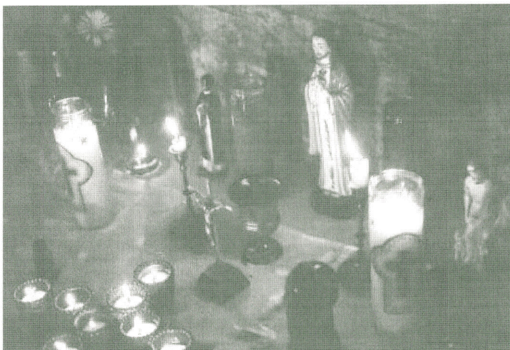
A curandero's working altar, showing objects that include the historical influences on Mexican American healing traditions.

Curanderismo: A Picture of Mexican-American Folk Healing