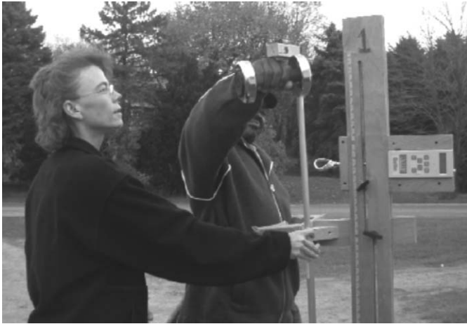
Fig. 2. Administration of the timed arm hold in the orchard.