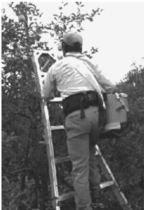
Fig. 1. An apple harvest worker climbs a ladder to pick apples using the intervention belt attached to his regular picking bucket.

As with the laboratory research, it was necessary to use an intermediate endpoint in the development of musculoskeletal strain because there currently exists no objective physical measure of the outcome. However, because it was