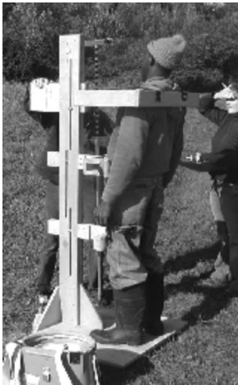
Fig. 3. Administration of the standing spinal extension in the orchard.

stand was constructed that allowed the subject to perform standing up. Three repetitions of each measure were performed, with peak and mean exertion values recorded. A 15 s break was provided between each spinal extension repetition, and 1 min between each arm-hold repetition.