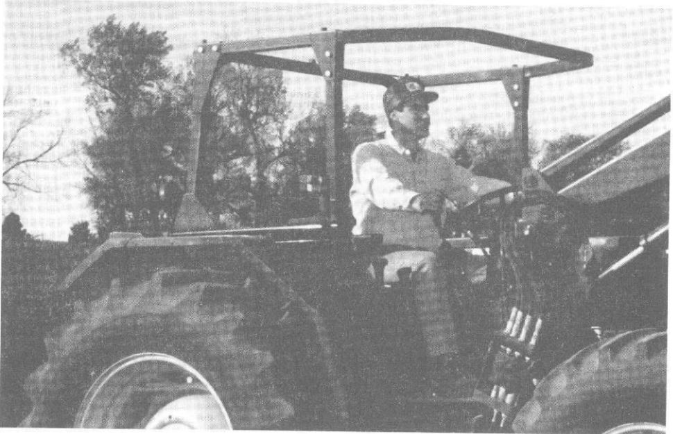
FIGURE 1. Rollover protective structure on a farm tractor

employers to provide ROPS and seatbelts for all employee-operated tractors † manufactured after October 25, 1976 (2). Although virtually all tractors sold after 1985 have been equipped with ROPS, farms with <11 employees are not subject to OSHA inspection or enforcement, and farms managed by family members with no other employees are not required to comply with OSHA standards; in Kentucky, 94% of the farms are family-owned businesses with <11 employees (5). The median age of tractors investigated in this report was 23 years. One fatal tractor rollover in this study involved a 1979 tractor manufactured without ROPS. Because it was purchased for use on a family farm without employees, it was not subject to the ROPS standard. The cost to retrofit tractors manufactured before 1975 ranges from $400 to $1800, and economic constraints associated with farms in Kentucky limit the feasibility of appropriately modifying all tractors.