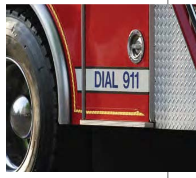
If pesticide drift is making people sick, call 911 right away.

Scientists recognize that almost every pesticide application produces some amount of drift off the target area. Not all drift may be harmful or illegal. How much a chemical may drift and whether it is harmful depends on such factors as the formulation of the product, the amount used, the application method, the weather, and – most critically – decisions by the applicator.