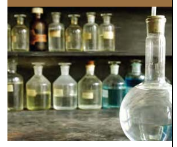
Pesticides typically contain several ingredients, any one of which may produce a sickening odor.

A breakdown product is the result of a chemical breaking apart into other chemicals. Some kinds of pesticides break down when exposed to sun or rain, or to bacteria found in soil. The breakdown is a natural process that may produce a compound that is more or less toxic than the original chemical. Many common pesticide breakdown products contain sulfur, which has a particularly bad smell.