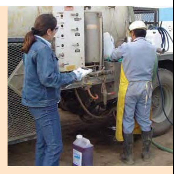
To investigate complaints, staff from the County Agricultural Commissioner's office will gather evidence to find out if pesticide laws were broken.

After the Agricultural Commissioner's staff complete their investigation, they prepare a report describing what occurred. If they found violations, they can also assess fines and other penalties. Agricultural Commissioners send their reports to DPR where scientists look for illness trends and potential problem areas. Scientists at DPR and the U.S. Environmental Protection Agency also rely on the information to improve use practices and safety information on pesticide labels.