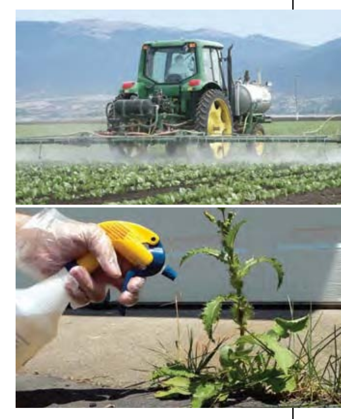
Anyone who uses pesticides – whether a farmer, professional pest control company, your neighbor, or you – must follow the law and the pesticide label and be careful to avoid harming themselves, anyone else or the environment.