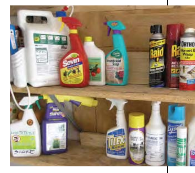
Bring the pesticide container with you when you go to the doctor. The information on the label will help with diagnosis and treatment.

If you are outdoors, move to where you can't smell the pesticide. You may need to move some distance away.