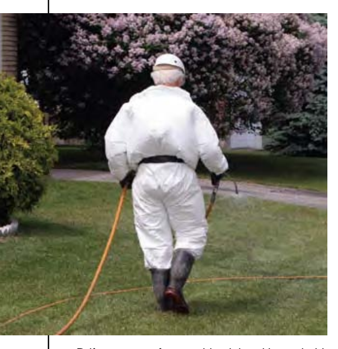
Drift can occur from residential and household pesticide applications, too. It can even happen indoors.

Because some drift can occur with any application (and may be in amounts too small to affect people or property), the laws focus on preventing substantial drift.