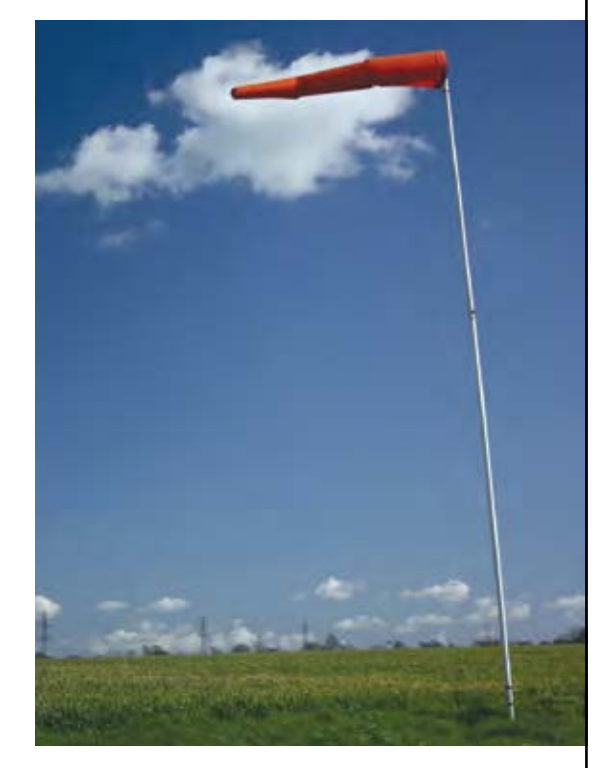
To prevent harmful drift, applicators must evaluate their equipment, the surrounding area, weather conditions, and anything else that may cause problems.

Must not make an application likely to result in harmful drift.