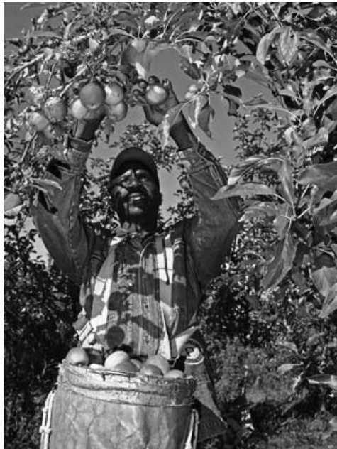
An apple picker at work.

Maine Migrant Health Program Clínicas de Salud del Pueblo Avenal Community Health Center Cherry Street Health Services