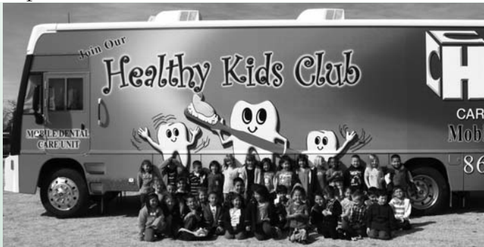
Local children gather for a picture in front of Community Health Centers of Lubbock's mobile health unit.

property owners are typically receptive to these conversations and have graciously offered their properties to the CHCL mobile health unit as designated sites to park and provide services to tenants and the community at large. CHCL repeatedly emphasizes to property owners that they bear no financial or legal liability for the services offered by the MHU to their tenants.