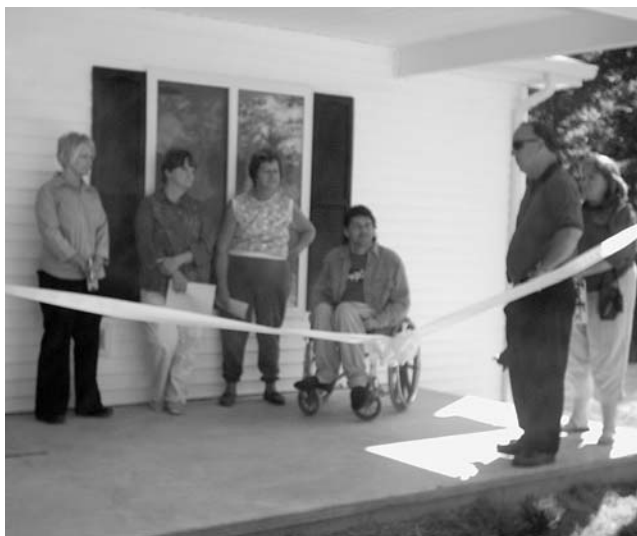
One of the patients of KMHA's Assertive Community Team celebrates getting a new home.

Outside In operates the Road Warrior Access Project, which includes nighttime drop-in clinical services specifically for youth. During this time, they also offer hot meals and movies in a comfortable environment. Many health centers have established evening hours, but what FHSI particularly liked about this practice is that it takes this concept a step further by reaching out to a population needing more than just health care. Homeless youth need a home and Outside In attempts to replicate the home environment in order to build trust and increase access to health care.