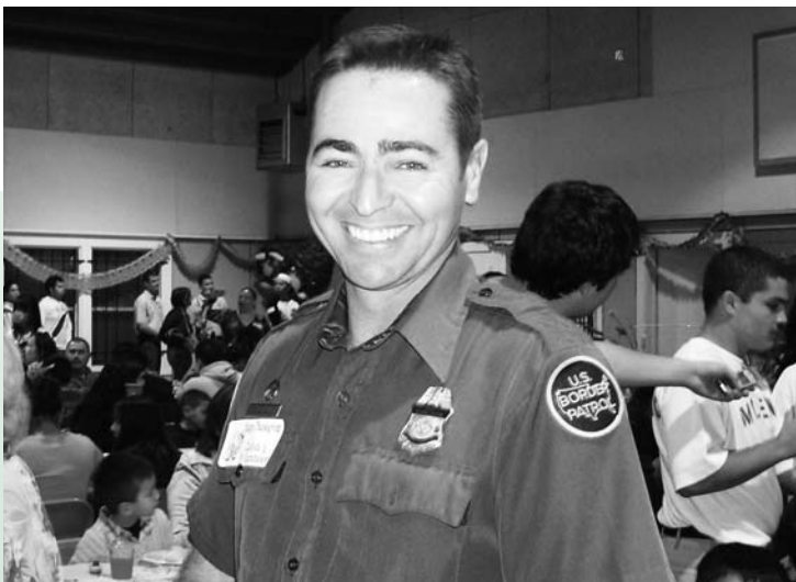
One of the Border Patrol volunteers at Casa Familiar's annual "American Traditional Thanksgiving Dinner."

One of the most successful demonstrations of this collaboration is at Casa Familiar's annual "American Traditional Thanksgiving Dinner" that hosts over 1,000 community members of all ages in a family dinner setting, with Border Patrol agents volunteering as the official servers of the meal. This event is a testament to the community's ability to break down barriers, build bridges, establish trust, and forge relationships among unlikely partners.