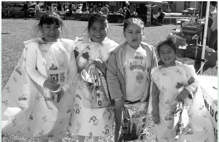
Local children wear the free lab coats given away as part of the “Children’s Doctor Dress-Up” booth at the Yuba-Sutter Binational Family Health Fair.

Families are encouraged to participate in a family-fun walk in addition to the music, ethnic foods, raffle prizes, and other entertainment offered throughout the day in order to insure a successful outreach event. Over 30 agencies typically collaborate on the event and participants are encouraged to take home the event passport flyer that includes the phone numbers of agency booths. The goal of the event is to educate attendees about the importance of the prevention and treatment of illnesses. In just two years, the fair has become the premier health fair and the most successful innovative outreach tool within the greater Yuba and Sutter County Area.