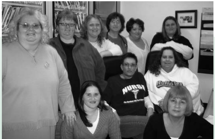
Members of the Assertive Community Outreach Team (shown above) provide clinical outreach, case management, and counseling services to homeless clients in Southeast Kentucky.

Every team member takes an active roll in the persistent monitoring and treatment of all clients served by the program. Because each staff member is kept updated about all clients served by the program, staff are quite comfortable rotating shifts and sharing caseloads. This collaborative environment also helps decrease the chances of burnout and exhaustion among the outreach staff. In addition, these meetings can be somewhat therapeutic releases for the hardworking members of the Assertive Community Outreach Team. They are consistently taxed with trying and sad situations from their homeless patients, so these daily meetings enable team members to openly discuss any feelings or ask for colleague support.