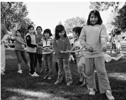
Kids playing a game of tug of war at Del Norte's Binational Health Fair.

Nominations for the award are based on the submission of innovative outreach practices by 330(g)-funded organizations. The recipient of the award in each stream is announced and presented with the award before their peers annually at the corresponding Migrant Stream Forum.