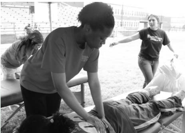
Volunteer osteopathic medical students from the University of Medicine and Dentistry of New Jersey work with participants at the Back Pain Clinic at the 2008 Farmworker Festival in Penns Grove, NJ.

Since some farmworkers were timid to come up and request services from the mobile van, it seemed logical to merge it with the Back Pain Clinic. This has proven very successful, as farmworkers come to receive services from the Back Pain Clinic and are then referred to the mobile van for medical treatment.