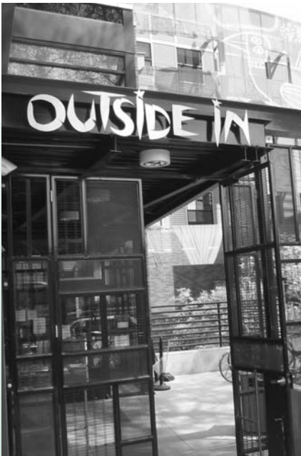
The entrance to Outside In, an agency dedicated to reaching out to homeless youth in the Portland area through the Road Warrior Access Project.

The Road Warrior Access Project operates on a drop-in basis Mondays from 10:00 PM to midnight because homeless youth are reluctant to seek health and social services during regular clinic hours, especially if they are contending with substance abuse, severe mental health issues, or experiencing discrimination based on sexual orientation. Since the project maintains a consistent schedule with set hours, youth can depend on the program and seek out health services when they are needed.