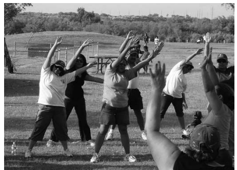
Members of the Community Leaders Group participate in exercise program sponsored by Clínicas de Salud del Pueblo.

FHSI's goal is to promote effective outreach approaches among any and all organizations serving farmworkers. In addition to gathering ideas from this report, reflect on what makes your outreach program innovative and share your unique approaches, projects, and ideas with your outreach peers. You can submit your success stories for future editions of this report through a simple form on our website.