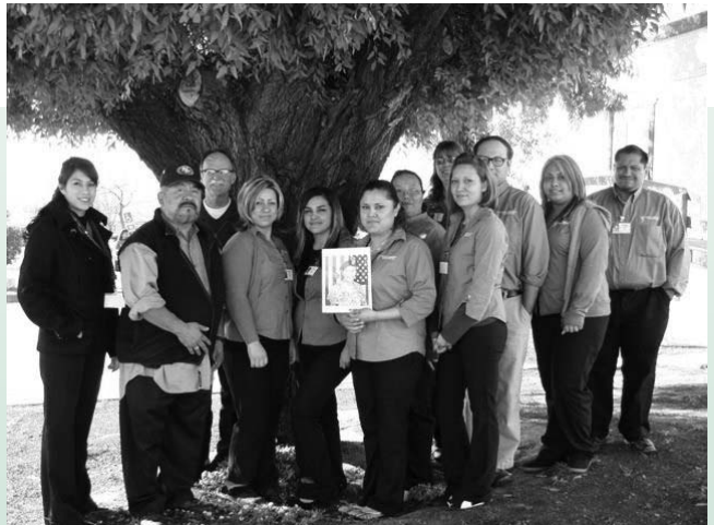
Avenal staff (pictured above) provided Sunday clinic services to male farmworkers.

At the end of the visit, patients were given a lunch bag also filled with information on diabetes, asthma, pesticides, and dental care. Water bottles were given as incentives for completing the exit survey; according to the resulting feedback, all 28 patients liked the price of the services, how they were treated, the attention they received, and that all services were received in one day. Most importantly, they felt comfortable and said they would visit the clinic again. Staff working that day felt satisfied; the atmosphere was great, and everyone worked as a unified team.