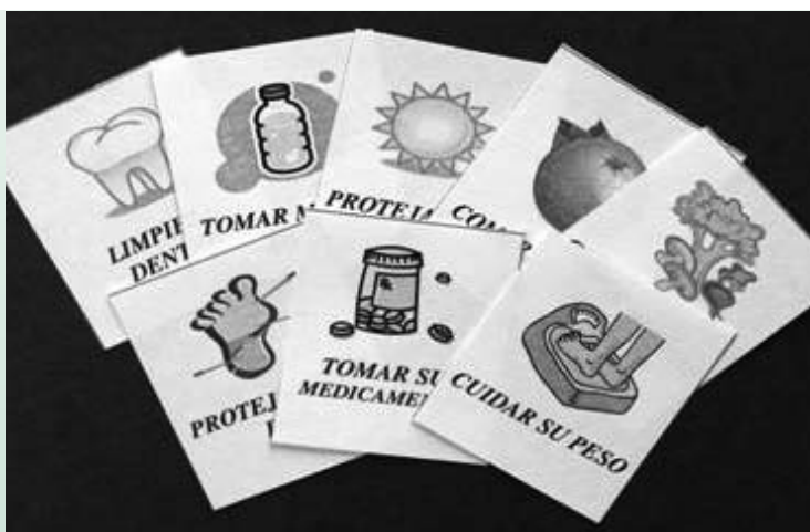
Raffle tickets with health messages used by Clinic Ole's outreach program to promote wellness among farmworkers.

Those who otherwise may not be willing to speak out during lectures are suddenly prompted to share their insights in a specific health topic once their ticket is drawn. Finally, this activity also serves to reinforce simple health concepts that empower farmworkers to foster a consciousness that enables them to take the steps needed to maintain a healthy mind, body, and spirit.