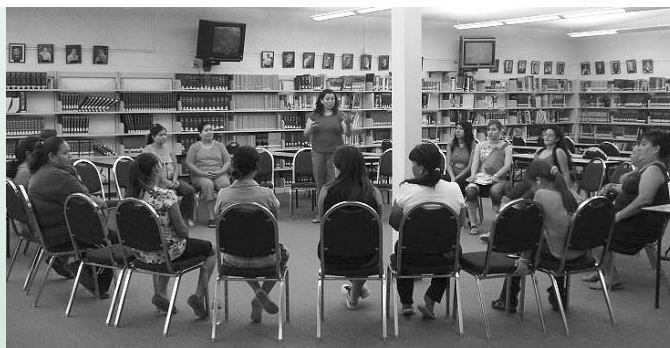
A Clínicas de Salud del Pueblo staff member leads a discussion about teen pregnancy with local parents as part of the Hablando Claro program.

Clínicas credits the success of the program to, 1) the involvement of a Community Leaders Group or advisory council, comprised of teens, local adults, and promotoras ,