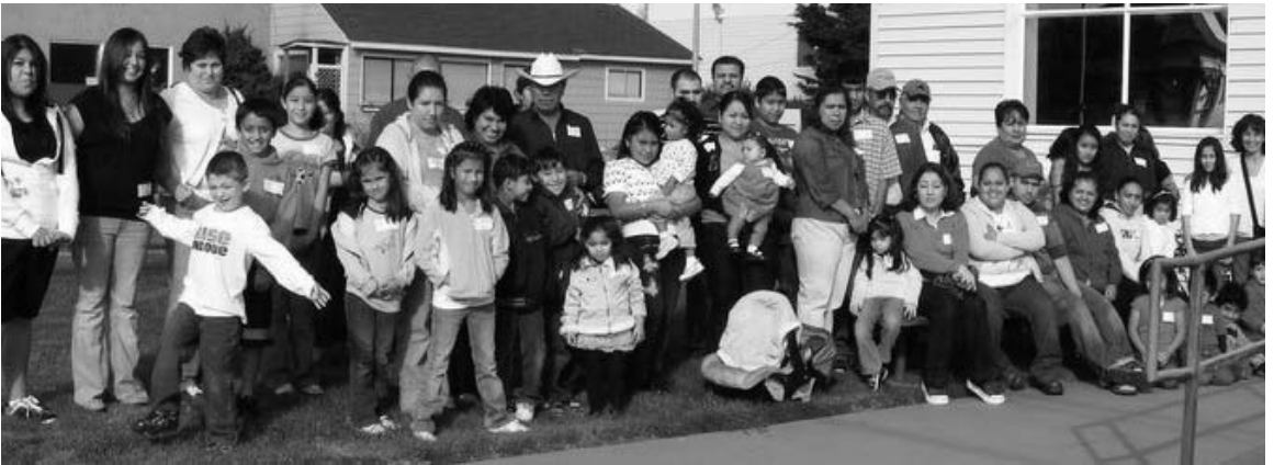
Día de la Familia , or Hispanic Family Day, participants gathered outside of the Plaza Comunitaria for a panoramic picture.