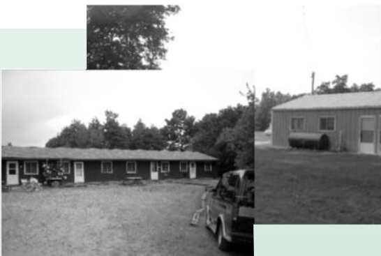
Sample pictures used in the Cherry Street camp profile portable field tool.

The outreach team began by combining readily-available logistical information from internet sources with digital photographs and valuable field information in order to generate a field guide for farmworker outreach activities that will be available for years to come. Resources used include Google Maps and the Michigan Department of Agriculture website, which has a listing by county of all registered migrant labor camps in Michigan.