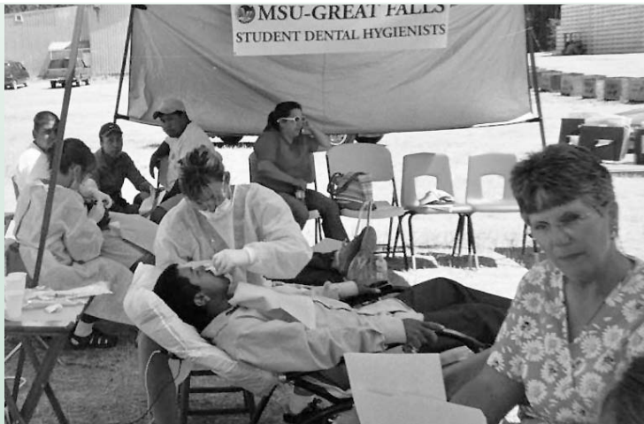
Montana State University dental students gain in-field, professional training by providing dental services to cherry harvesters in Western Montana.

Inside the unit, students conduct extractions, fillings, and sealings. Outside of the unit, they provide dental exams, hygienist screenings, cleanings, and health education. These services increase farmworkers' access to dental care as well as their likelihood