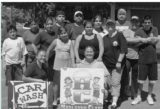
Members of the Community Leaders Group Advisory Council participate in a fundraiser organized to support council activities.

Including teens in the Community Leaders Group was one of the original and innovative components Clínicas added to their Hablando Claro Pregnancy Awareness Program. The idea stemmed from Clínicas' commitment to full-community participation in the design, implementation, and evaluation of the program. Though the program targets adults, Clínicas felt teens needed to be part of the Community Leaders Group to keep the program focused on the needs of teens and provide input about how teens can better understand their message. To date, one-fifth of the people reached by Hablando Claro have been under 20 years old, which would not have been possible without the influence of the Community Leaders Group.