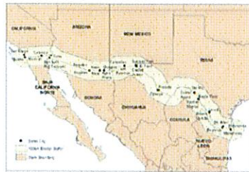
Figure 1 US/Mexico border map with the lighter shaded section indicating the region of interest.