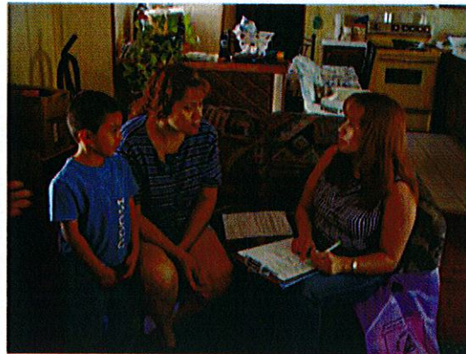
Figure 3 Promotora conducting an environmental health/home assessment, reviewing conditions inside a home.

A set of two environmental health/home safety visits were made by a promotora to every client's residence. The first home visit involved the identification of environmental hazards in and around the homes, educating the client on pesticide safety, and other observed environmental health/home safety issues (Figure 3). The second home visit involved the observation of the client's behavior change towards their ability to reduce the risk of pesticide exposure within the home. All materials and home visits were conducted in Spanish or English, depending upon the client's language preference; the majority of the visits were conducted in Spanish.