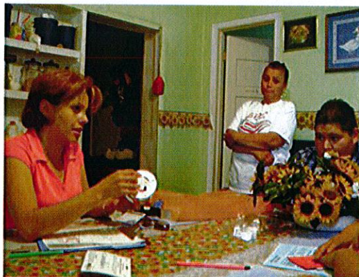
Figure 4 Promotora conducting a follow-up visit in a client's home.

received a certificate of completion by mail after the evaluation form was returned to the SoAHEC office.