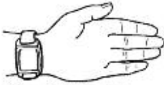
This special VNS Therapy™ System magnet is worn on the wrist.

Not everyone with an implant has a warning before a seizure begins. However, during a seizure, family members and caregivers can also be shown how to pass the magnet over the implant. This may help to shorten or stop the seizure completely.