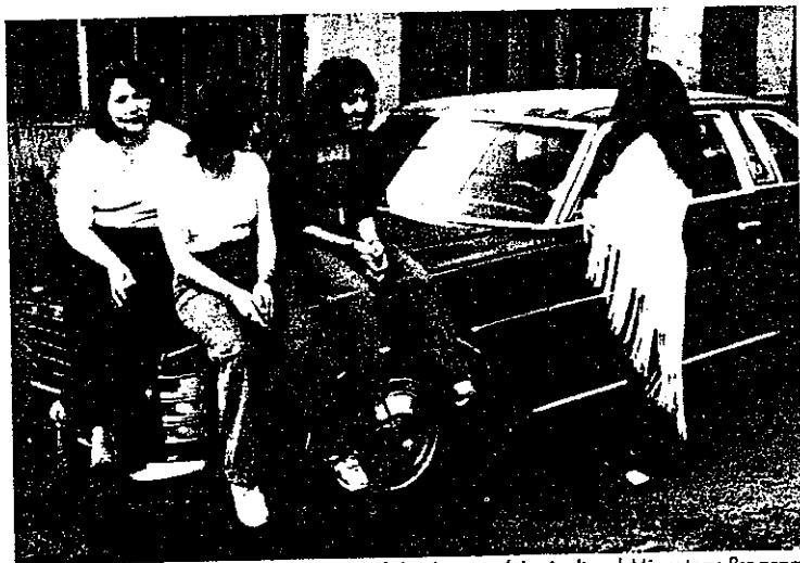
Courtesy of the Seasonal Agricultural Migratory Program of the California Department of Health Services